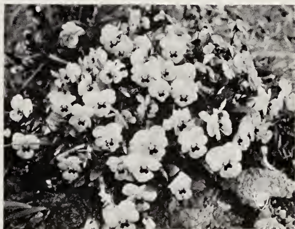
APRICOT VIOLA MAROON BEAUTY

APRICOT VIOLA MAROON BEAUTY —The rich apricot yellow of this flower is enhanced by its maroon colored center producing a most pleasing contrast. Flowers in greatest profusion, as seen in the illustration, during the whole season. 6 for 50c.